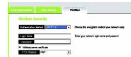
Figure 6-26: EAP-TTLS Authentication

Click Next to continue or Back to return to the previous screen.